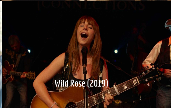
Wild Rose (2019)