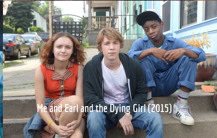
Me and Earl and the Dying Girl (2015)