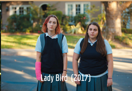
Lady Bird (2017)