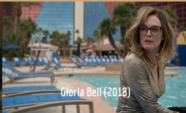
Gloria Bell (2018)