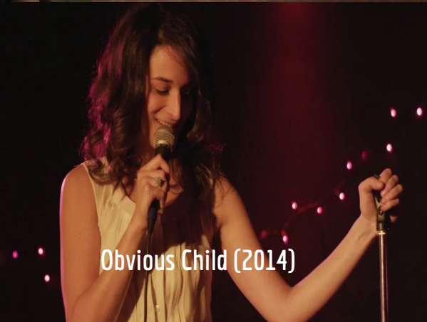
Obvious Child (2014)