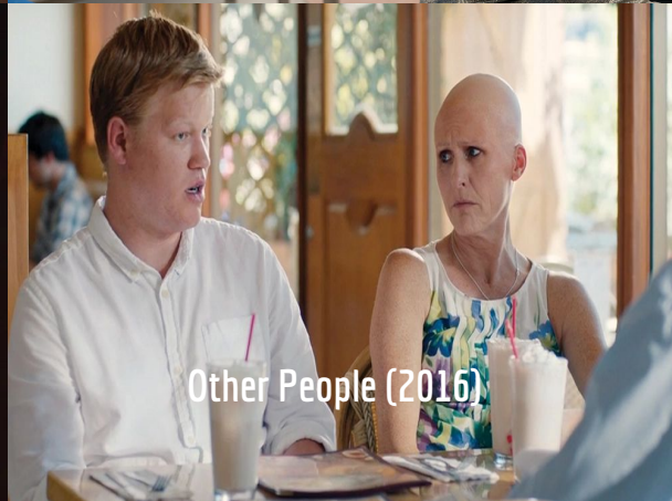
Other People (2016)