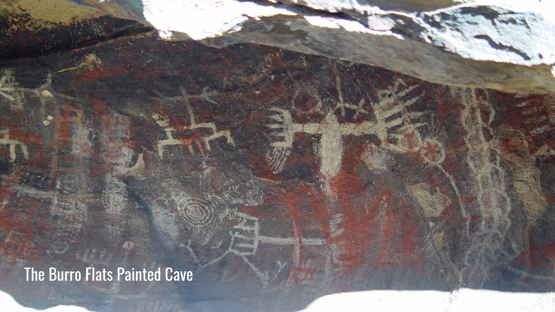
The Burro Flats Painted Cave