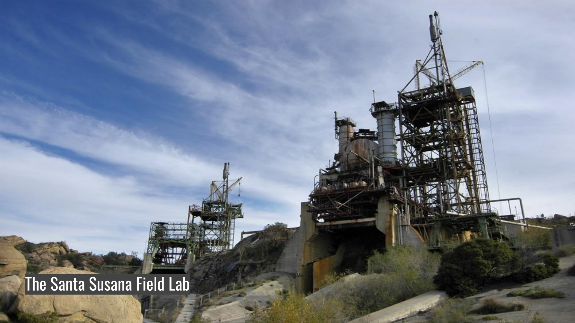
The Santa Susana Field Lab